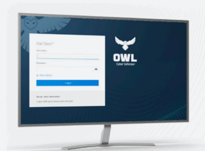
Talon 3 User Interface

Featuring a modern, web-based user interface, the Owl Talon software platform is extremely easy to use. In just minutes, you can configure your data flows from source to destination, getting you up and running faster than ever before.