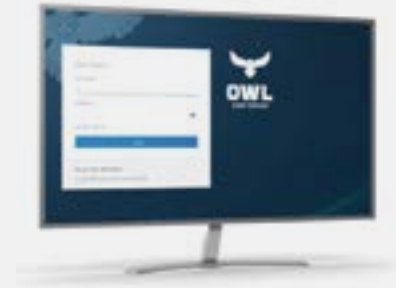
Talon 3 User Interface

Featuring a modern, web-based user interface, the Owl Talon software platform is extremely easy to use. In just minutes, you can configure your data flows from source to destination, getting you up and running faster than ever before.