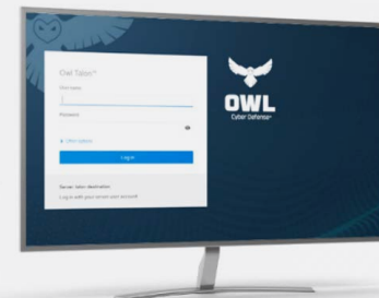
Owl Talon User Interface

Featuring a modern, web-based user interface, the Owl Talon software platform is extremely easy to use. In just minutes, you can configure your data flows from source to destination, getting you up and running faster than ever before.