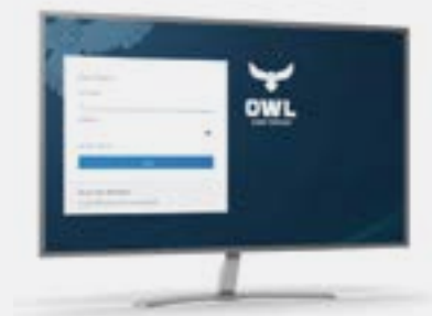
Talon 3 User Interface

Featuring a modern, web-based user interface, the Owl Talon software platform is extremely easy to use. In just minutes, you can configure your data flows from source to destination, getting you up and running faster than ever before.