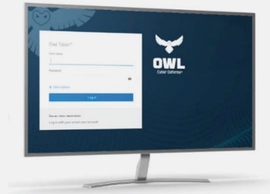
Talon 3 User Interface

Featuring a modern, web-based user interface, the Owl Talon software platform is extremely easy to use. In just minutes, you can configure your data flows from source to destination, getting you up and running faster than ever before.