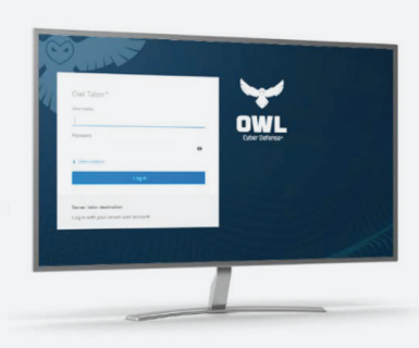
Talon 3 User Interface

Featuring a modern, web-based user interface, the Owl Talon software platform is extremely easy to use. In just minutes, you can configure your data flows from source to destination, getting you up and running faster than ever before.