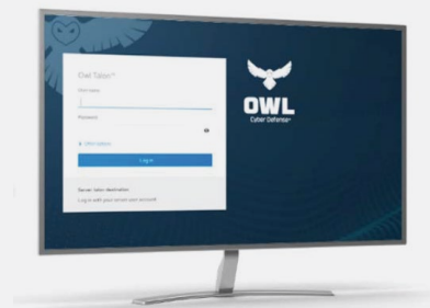
Talon 3 User Interface

Featuring a modern, web-based user interface, the Owl Talon software platform is extremely easy to use. In just minutes, you can configure your data flows from source to destination, getting you up and running faster than ever before.