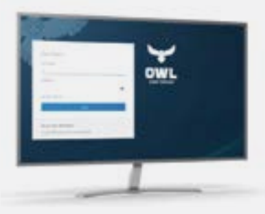
Talon 3 User Interface

Featuring a modern, web-based user interface, the Owl Talon software platform is extremely easy to use. In just minutes, you can configure your data flows from source to destination, getting you up and running faster than ever before.